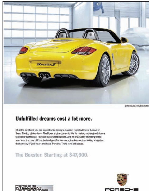
FIGURE 1.1 Porsche: “Unfulfilled dreams cost a lot more”