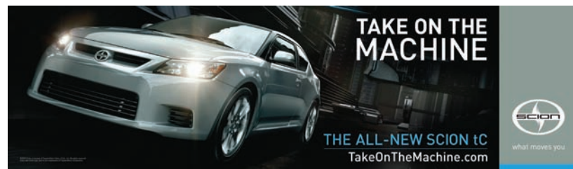
FIGURE 1.2 Scion: “Take On The Machine”