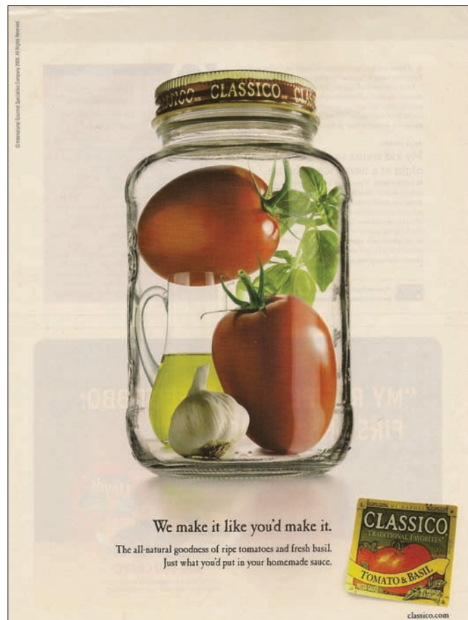
FIGURE 1.3 An Illustration of the Marketing Concept

The production concept , a business approach conceived by Henry Ford, maintains that consumers are mostly interested in product availability at low prices; its implicit marketing objectives are cheap, efficient production and intensive distribution. This approach makes sense when consumers are more interested in obtaining the product than they are in specific features, and will buy what's available rather than wait for what they really want. Before the 20th century, only wealthy consumers could afford automobiles, because cars were assembled individually and it took considerable time and expense to produce each vehicle. Early in the 20th century, Henry Ford became consumed with the idea of producing cars that average Americans could afford. In 1908, Ford began selling the sturdy and reliable Model T for $850—an inexpensive price for that day. Soon he found out that he could not meet the overwhelming consumer demand for his cars, so in 1913 he introduced the assembly line. The new production method enabled Ford to produce good-quality cars more quickly and much less expensively. In 1916, Ford sold Model Ts for $360 and sold more than 100 times as many cars as he did in 1908. 2 In only eight years, Americans got the product that led to our nation's extensive system of highways and the emergence of suburbs and large shopping malls.